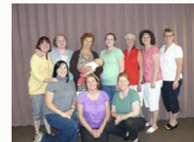
RIE I Tulsa, OK, USA June 17-26